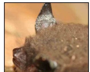
Fungal growth on ear.