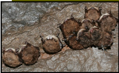
Little brown bats: single bat in center has white-nose syndrome