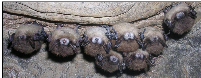
Little brown bats with White-Nose Syndrome, New York.

Fungal transmission is not fully understood. Disease spreads bat to bat but humans can also play a role. Cavers, other recreationists such as geocachers, people frequenting mines, and bat biologists, may spread the disease through spores on boots, clothing, or equipment. Accidental translocation of infected bats via long-haul transport vehicle may also spread the disease.